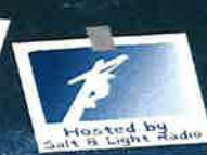
Hosted by Salt & Light Radio